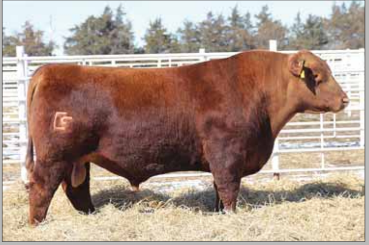
J6RA BKE Indeed, sire of Lots 5 - 12, 61 - 64, and 66 & 67.