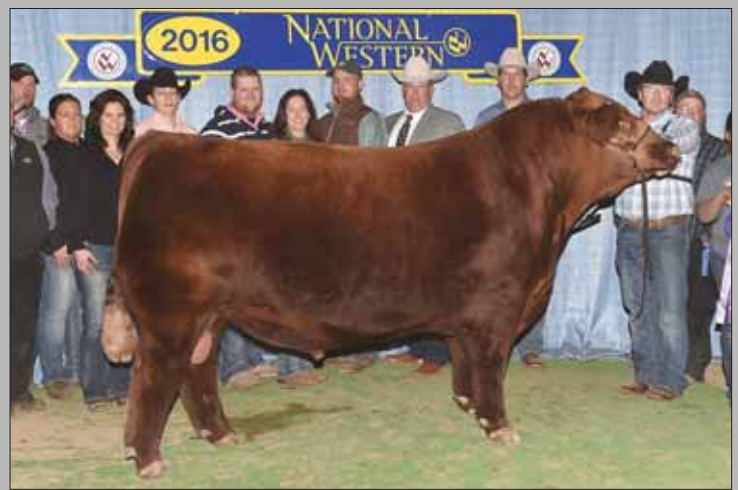
Six Mile Taurus 519A, sire of Lots 1, 2, 3 & 4.