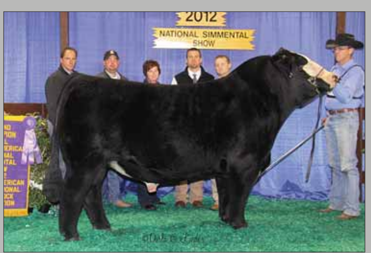
Mr HOC Broker, sire of Lots 42 - 44.